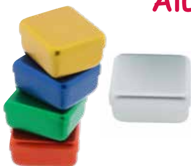
BOXES 5 X 4 X 3 CM*