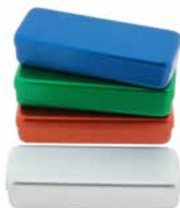
BOXES 10 X 3 X 2 CM*