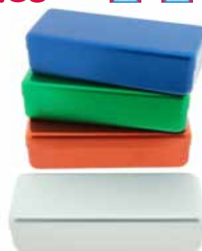
BOXES 13 X 5 X 3 CM*