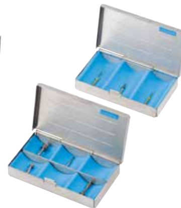
CASSETTES 11 X 6

Size 21 x 7 x 2 cm • Ref. 182096 ..... 6 compartments • Ref. 182095 ..... 12 compartments