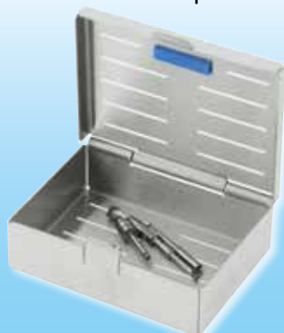
MICRO CASSETTE 2