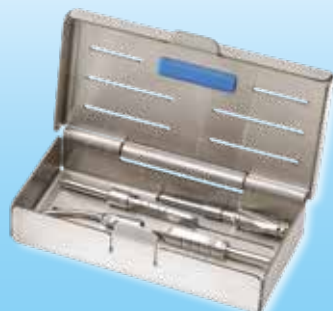
MICRO CASSETTE 1

Stainless Steel and silicone. The ultimate cleaning and sterilizing container for all kind of small instruments and accessories. Complete with 4 interchangeable colour indicator strips 2 3 4 5