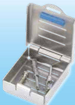
MICRO CASSETTE 3