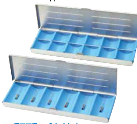
CASSETTES 21 X 6

Size 21 x 13 x 2 cm • Ref. 182076 ..... 12 compartments • Ref. 182075 ..... 24 compartments